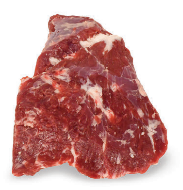
RIBEYE LIP-ON HEAVY CHOICE