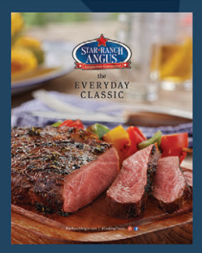
RIBEYE - 22" X 28" #19502