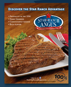
T-BONE - 22" X 28" #17272