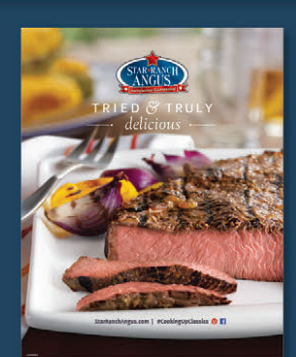
SIRLOIN - 22" X 28" #19501