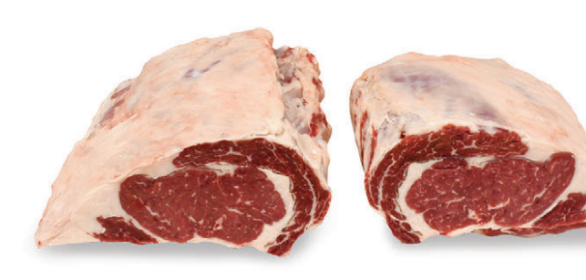
RIBEYE LIP-ON BONE-IN CHOICE