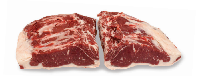
LOIN STRIP 0X1 CHOICE