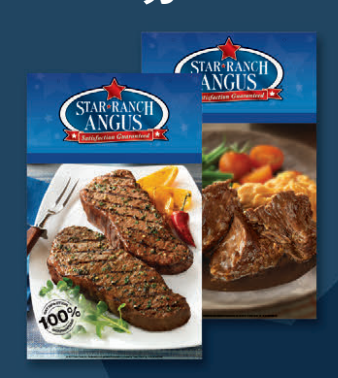
FOAM - 22" X 36" #17323