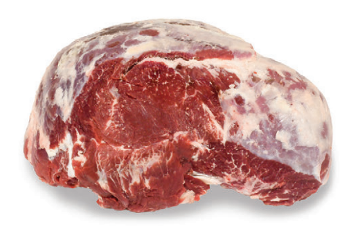
ROUND EYE CHOICE